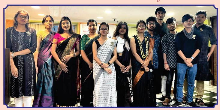
26th Rotaract Installation on 19.08.22